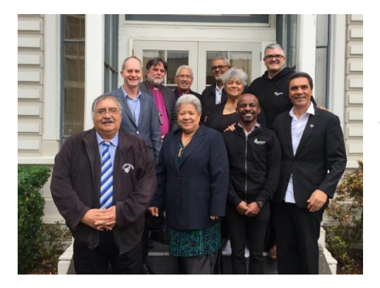
Photo: Anglican Missions Board and CEO at Anglican House 5th April 2019

Anglican Missions Board of the Church in Aotearoa, New Zealand and Polynesia Te Poari Mihinare mo te Hâhi ki Aotearoa, Niu Tireni me Pasifika · Komiti ni Veivaka – Lotutaki ni Lotu Jaji e Aotearoa, Niu Siladi kei Polonisia