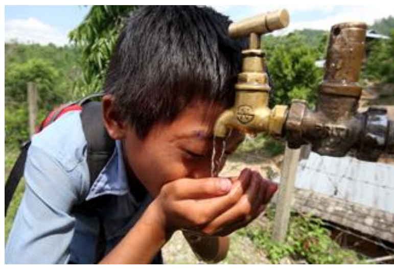
Children benefit from projects funded with your support.

Clockwise from top left: Short-term missions trip to Fiji by Waikanae Parish (funded from OM-TP grant); children at Saviour Evangelical School, Jordan, benefit from new teaching materials (funding from 2018 Lenten Appeal); young girl sitting outside her home in Maniava Village, Fiji (rebuilt 2018 with funding from Cyclone Winston emergency appeal 2017); providing water tanks has been an ongoing commitment (Water for All).