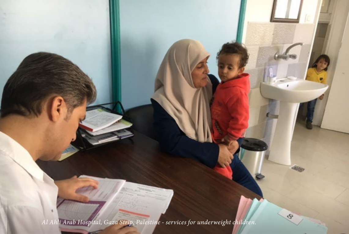
Al Ahli Arab Hospital, Gaza Strip, Palestine - services for underweight children.