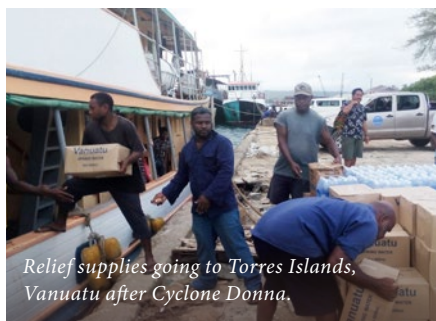
Relief supplies going to Torres Islands, Vanuatu after Cyclone Donna.