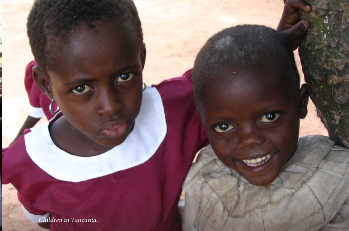
Children in Tanzania.

18). The aim of the Appeal was to raise NZ$15,000 but we received more than expected from donors and consequently were able to pay a larger grant which meant we were able to contribute an additional NZ$9,000 to help complete the building. It was officially opened on 13 October 2017.