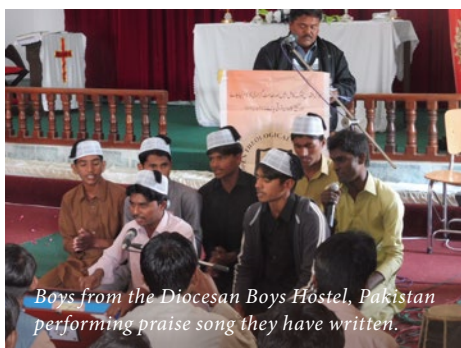
Boys from the Diocesan Boys Hostel, Pakistan performing praise song they have written.

transmitted overseas in accordance with the wishes of the donors. These specified donations are recorded as income and expenditure once they are distributed as they represent significant extra giving by the Church. (The donations are processed with no administration charge levied).