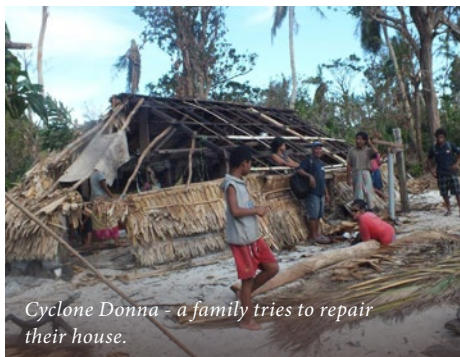
Cyclone Donna - a family tries to repair their house.

The second Emergency Appeal to support ACoM was in October 2017 after the Manaro Volcano on Ambae Island in Vanuatu began emitting ash and volcanic gas triggering concerns of an imminent eruption. After assessing the situation the government decided to evacuate all 11,000 residents from Ambae. Funding from Anglican Missions was used to procure emergency response items including food and water, and to help equip churches and church facilities which were used as evacuation centres. Again, due to the amazing generosity of our church in New Zealand, we sent a total of $18,060; NZ$5,000 for the initial response and then the balance later to assist with the resettlement of the Islanders.