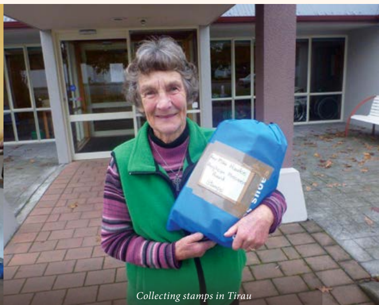
Collecting stamps in Tirau