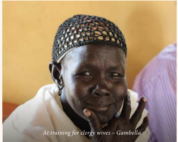
At training for clergy wives – Gambella

that the resettlement of the Landless People of Nadawa should start in 2015, and be completed by 2017.