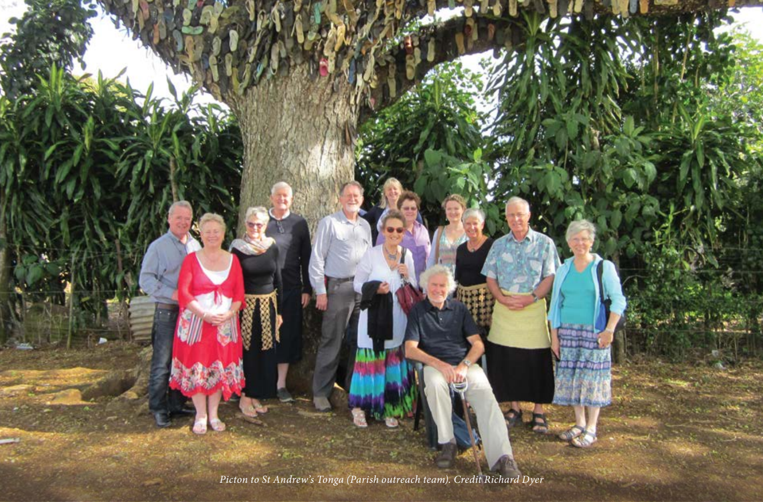
Picton to St Andrew's Tonga (Parish outreach team).

Taonga of the church, continued ownership and occupancy must also be seen to be commercially viable. During 2014, it is pleasing that it was able to generate a surplus of $11,000. We continue to be thankful for the provision of an office in such a strategic place, in Wellington. The access is easy for all public transport, and we are close to the Diocesan Office, and share good fellowship and relationship with the Anglican Church Pension Board. The Board Room at Anglican House is used regularly, both by