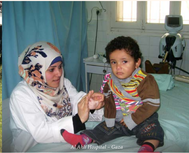
Al Ahli Hospital – Gaza