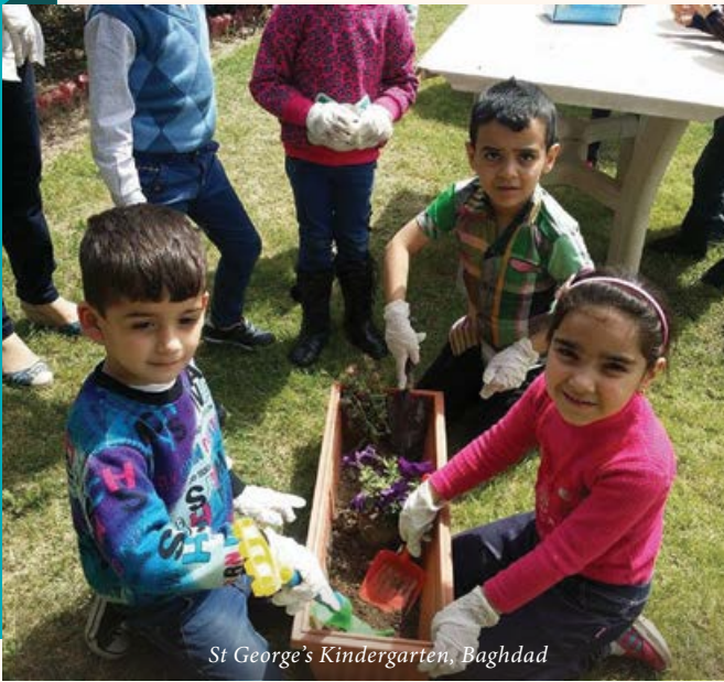
St George's Kindergarten, Baghdad