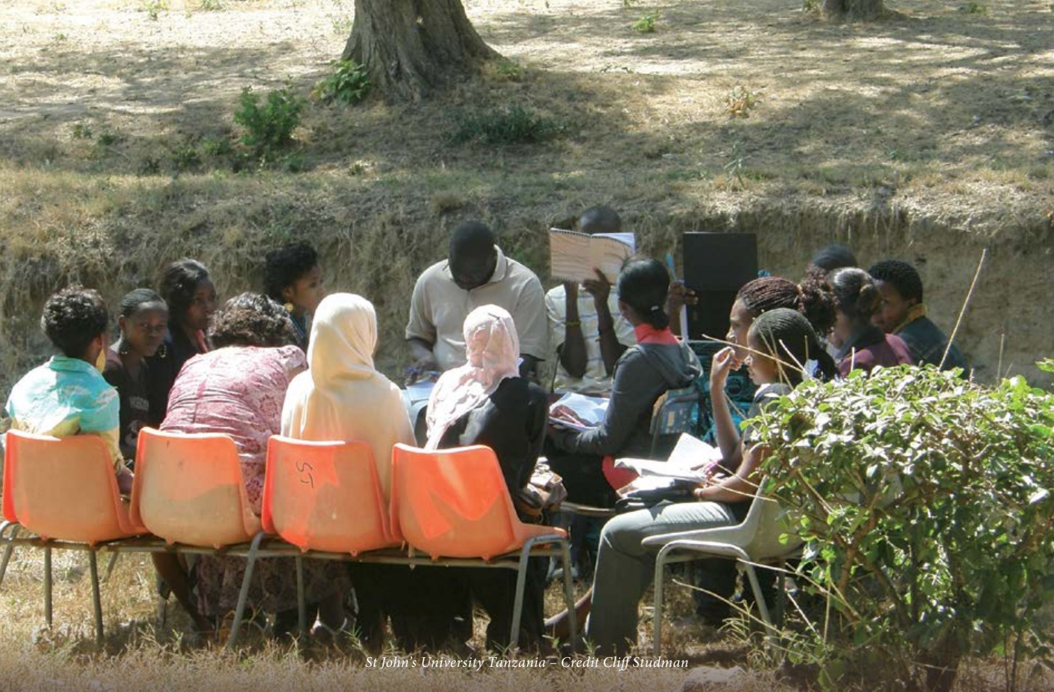
St John's University Tanzania