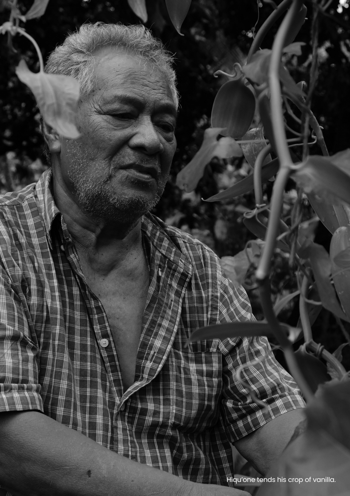
Hiq'one tends his crop of vanilla.