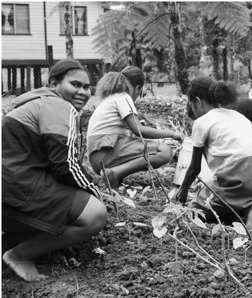
Wailoku young people plant vegetables, Fiji.