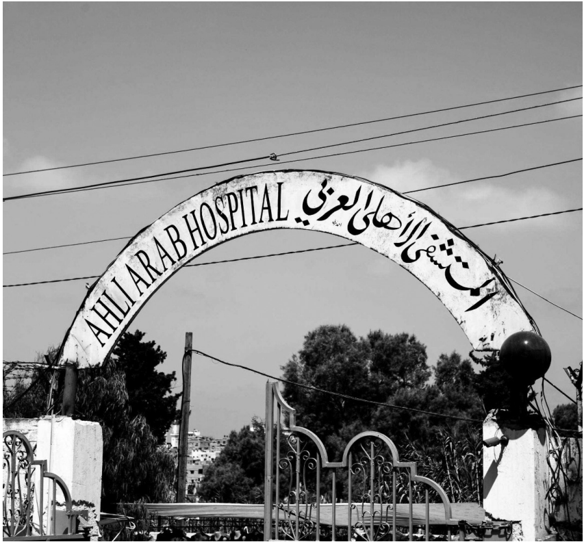
Al Ahli Hospital, Northern Gaza.