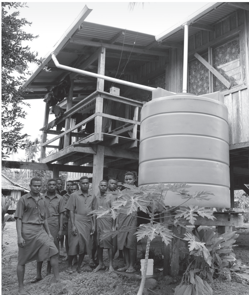
Melanesia Brotherhood stand in front of a water container, Solomon Islands.