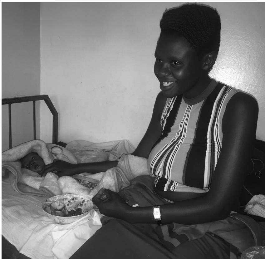
Mother and baby at the Rwenzori Special Needs Foundation in Uganda.