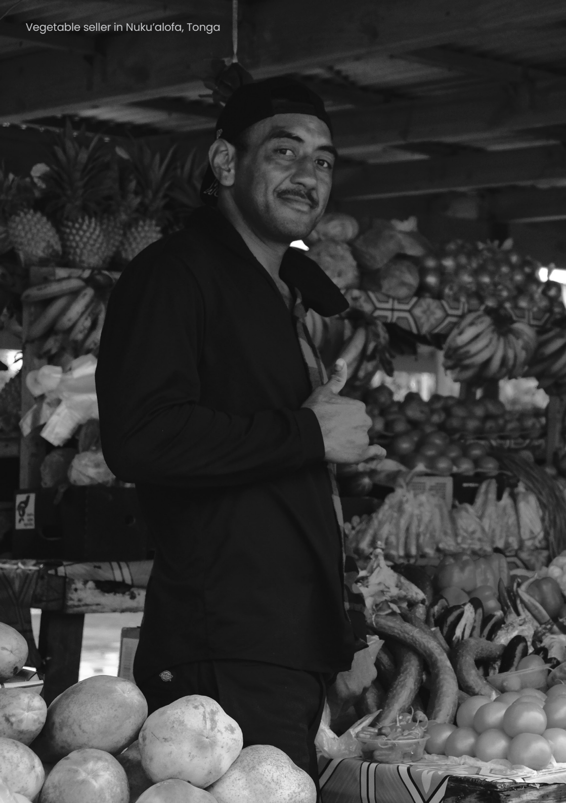
Vegetable seller in Nuku'alofa, Tonga