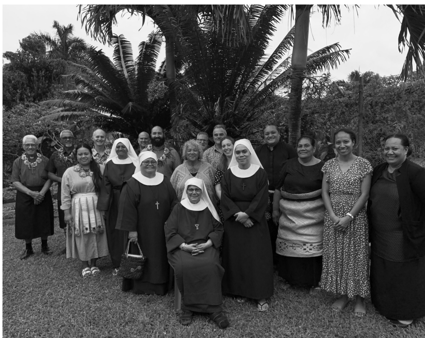
Members of the Anglican Missions Board meet with the Sisters of Moana St Clare.