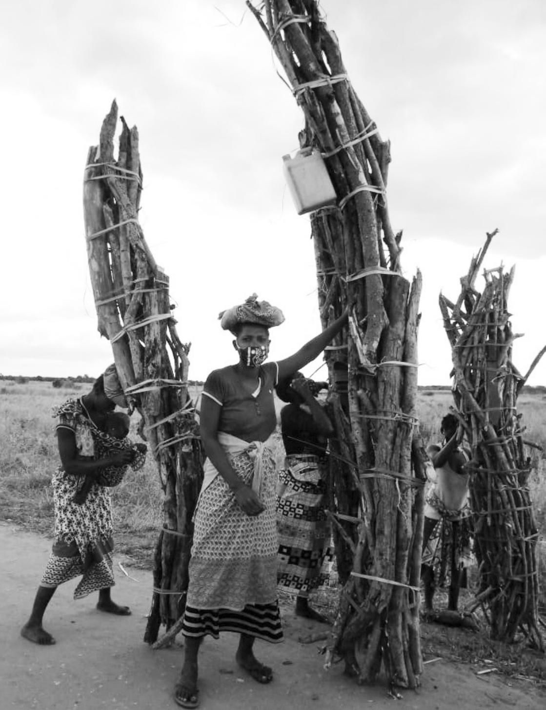
Women with firewood, Diocese of Niassa, Mozambique.