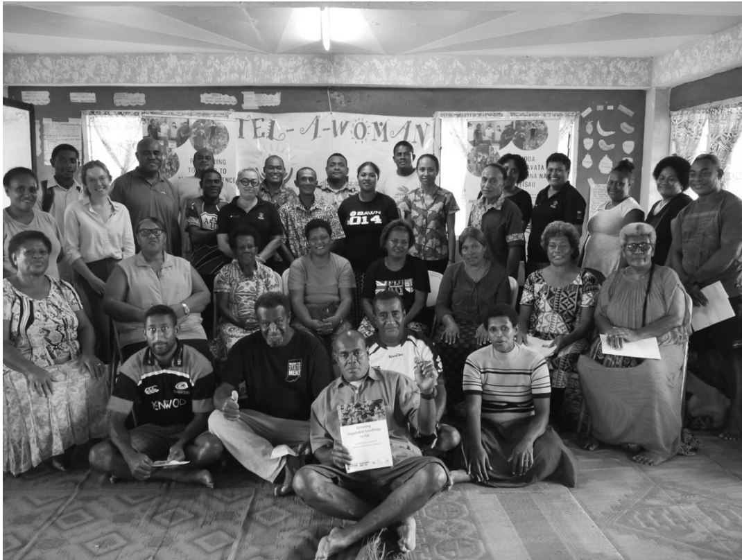
Graduates of a community gardening workshop with aims to create sustainable and climate resistant crops – Fiji 2022.

"We are afflicted in every way, but not crushed; perplexed, but not despairing." 2 Corinthians 4:8