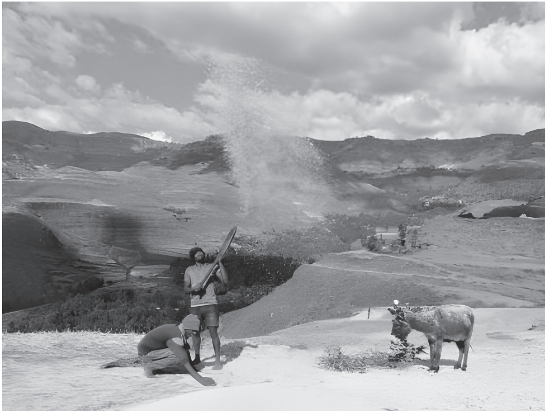
Grain is milled and processed, Baregota, Northern Ethiopia.