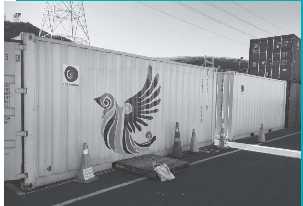
Prepositioned supply container in place, Tonga.

“ They all joined together constantly in prayer, along with the women and Mary the mother of Jesus, and with his brothers” Acts 1:14