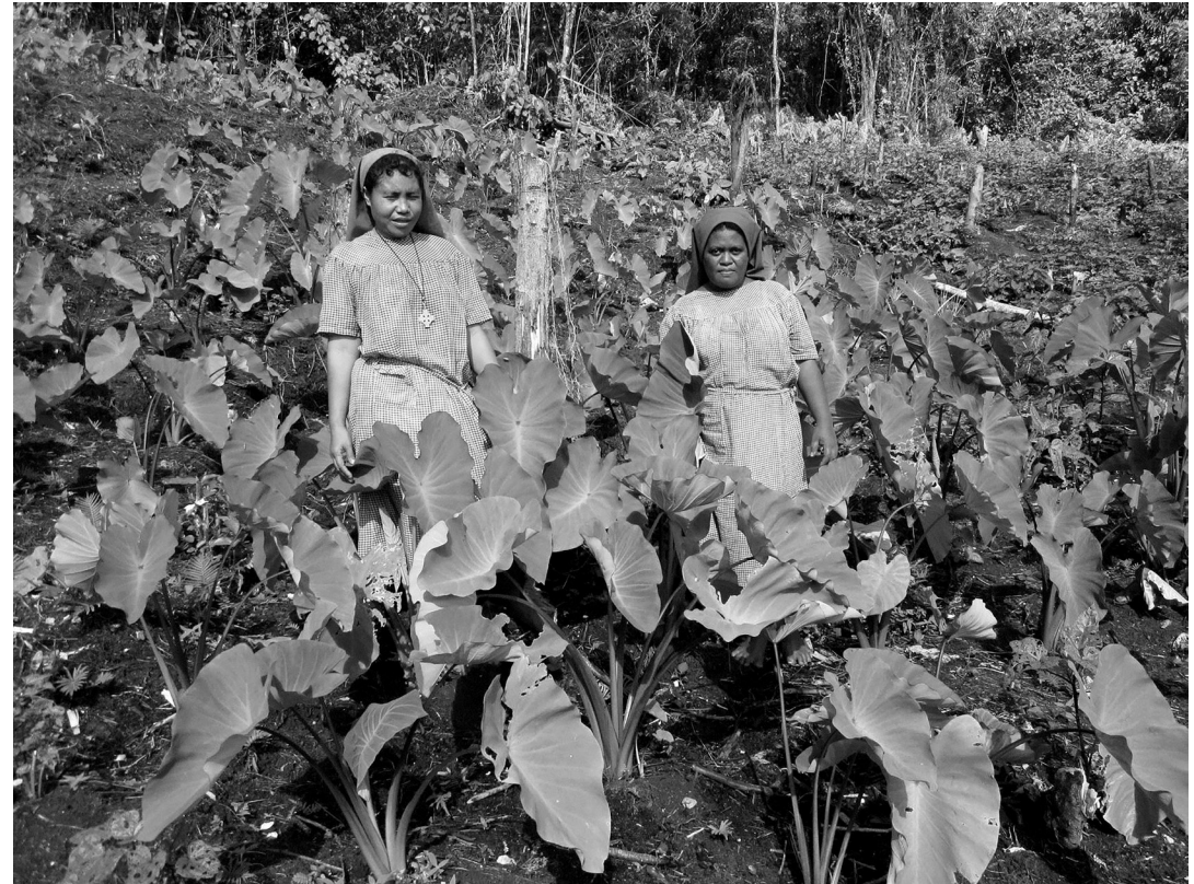
Melanesia Sisters working in their gardens, Solomon Islands (2021).

"I've had help from God to this day, and so I stand here to testify to both the powerful and the lowly alike, stating only what the prophets and Moses said would happen." Acts 26:22