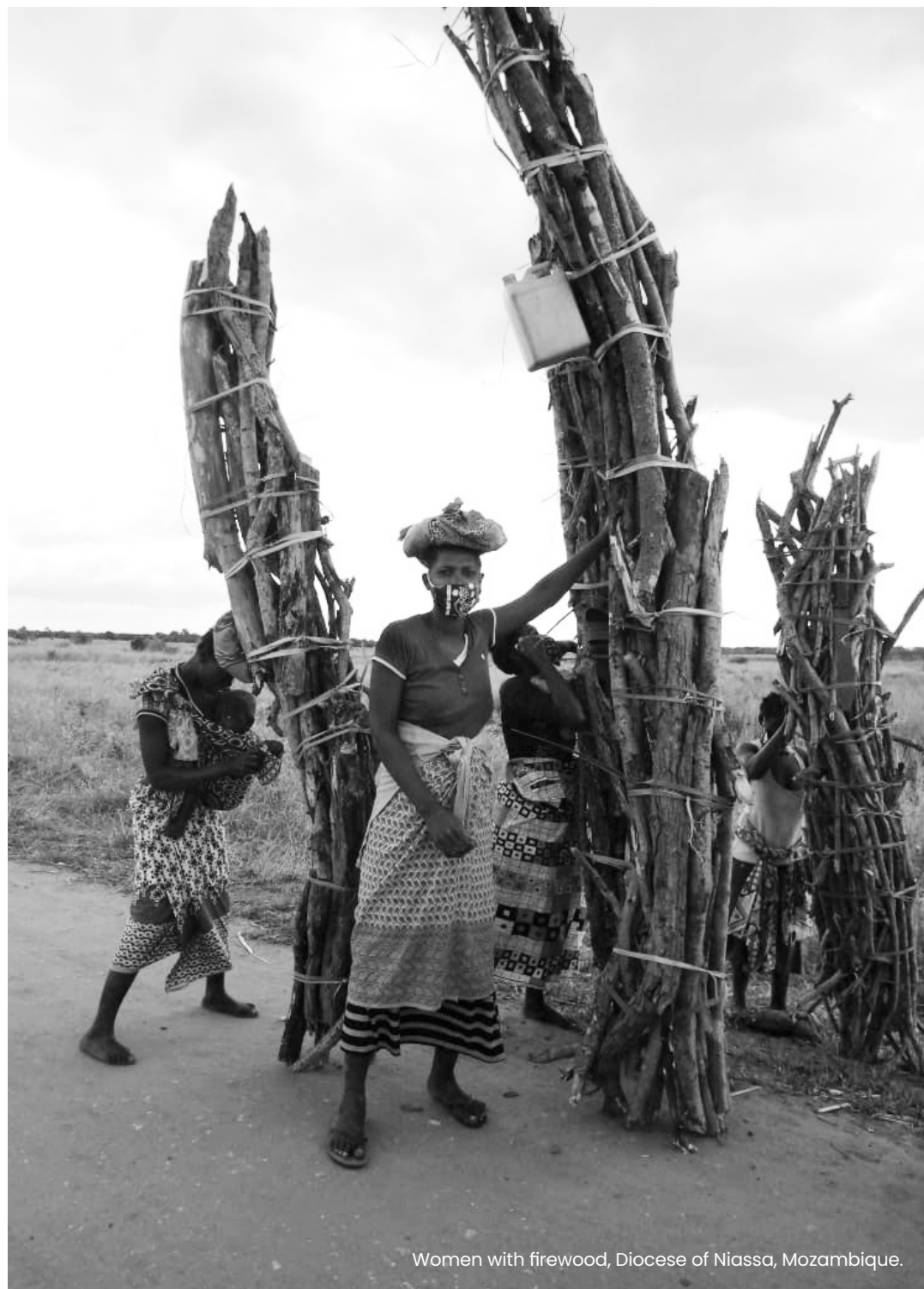
Women with firewood, Diocese of Niassa, Mozambique.

“His divine power has given us everything we need for life and godliness through the full knowledge of the one who called us by his own glory and excellence.” 2 Peter 1:3