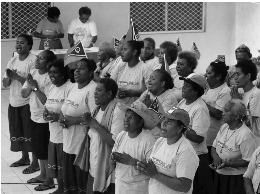
Mother's Union members from the Diocese of Vanuatu and New Caledonia.

"Again Jesus said, "Peace be with you! As the Father has sent me, I am sending you" John 20:21