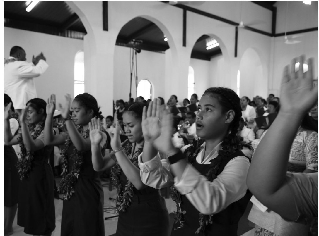
St Andrew's High School students singing (October 2022).

"Get up, for this matter is your responsibility, and we support you. Be strong and take action!" Ezra 10:4