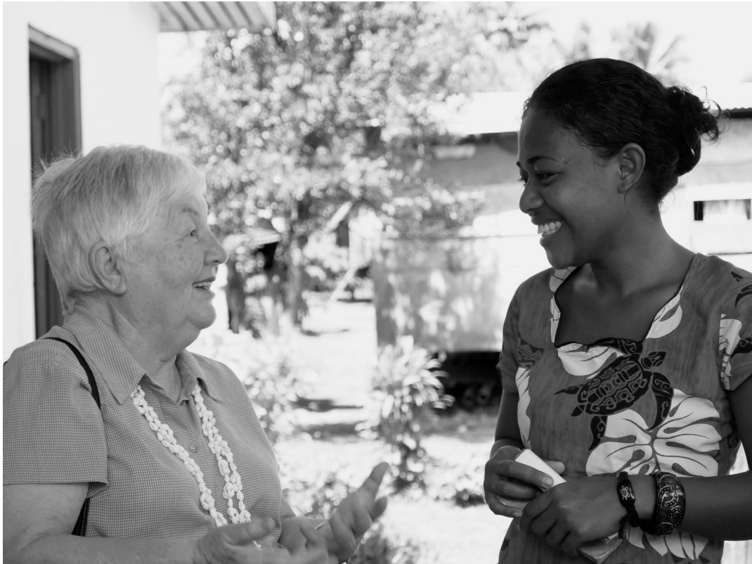
Discussions after church, Golden Oldies visit to Fiji (2022).